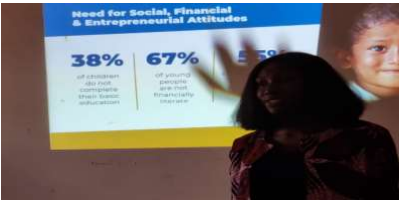
Top Right – some Members of the meeting with the Regional Coordinator Aflatoun; Top Left – The Regional Coordinator in the Middle, third from left. ED Coterie is second from Left