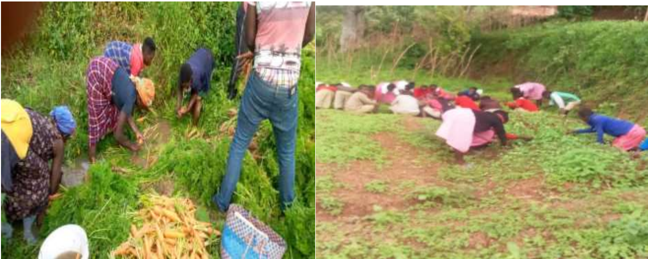
Right; Buhumba farmers harvesting carrots; Left; Pupils of Buranga Primary school in their garden.

Demonstration gardening has greatly improved people's livelihoods unlike before. People have got some food and additional income for more developments. Thanks to CII for the opportunity. These gardens don't consume a lot of space and can have variety of food stuffs that are readily available whenever needed. Almost every household in the 2 sub counties has a backyard garden. This has significantly reduced malnutrition and stunting among children in the community.