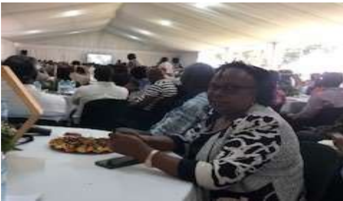
ED- Coterie attending the NFA meeting

On December 15 2023, all Forestry Stakeholders in Uganda converged at National Forestry Authority Offices in Bugolobi to discuss some of the issues affecting the Forestry sector in Uganda. NFA was established under section 52 of The National Forestry and Tree Planting Act and launched on the 26th April 2004. NFA is mandated to; "Manage Central Forest Reserves on a sustainable basis and to supply high quality forestry-related products and services to government, local communities and the private sector" NFA licenses several businesses such as Commercial forestry; Agri-tourism; Central Forest Management (CFM) and Land allocation.